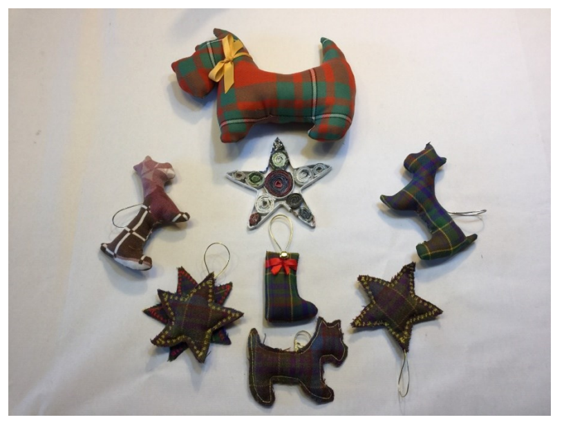
Image6: Christmas tree decorations with scrap fabric